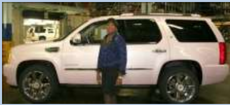
Brand New Cadillac Escalade Hybrid