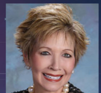
Gay Hope Super National Sales Director

Playback 712-432-1219 | Access code 686789784#