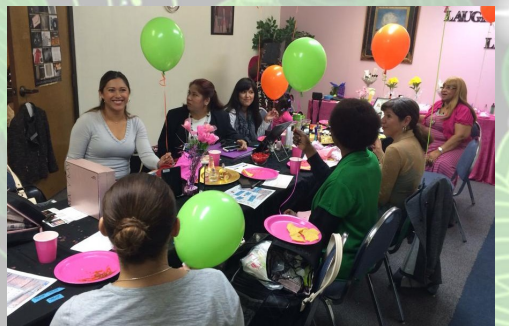
2014 Global Makeover Day!! Our Company broke a record again with over 58,000 makeovers in 1 day!! WOO HOOO!!

On Stage Recognition on Target Queens Court of Sharing and Queen's Court of Sales!!!