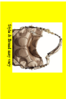
Style & Brand may vary