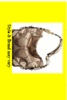
Style & Brand may vary