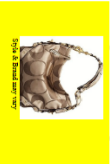
Style & Brand may vary