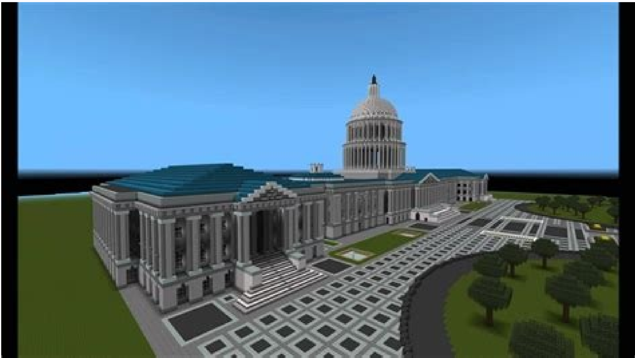
Top 10 things to build in minecraft creative. Cool things to build in creative minecraft. Good things to build in minecraft creative. Easy things to build in minecraft creative. Cool things to build in minecraft creative mode. Best things to build in creative minecraft. Things to build in minecraft creative when bored. Things to build in minecraft creative flat world.