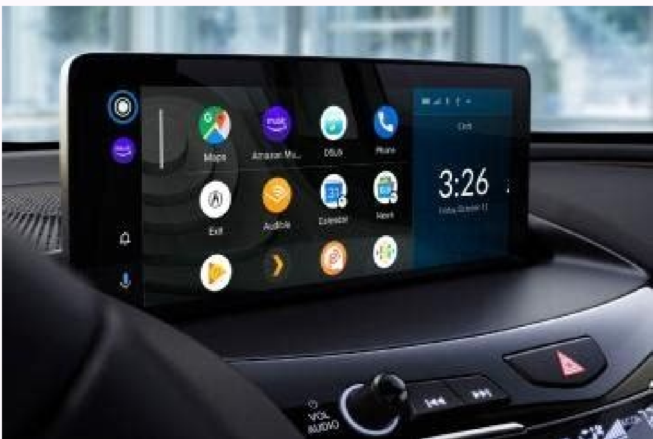
How to connect android auto to car. How set up android auto.